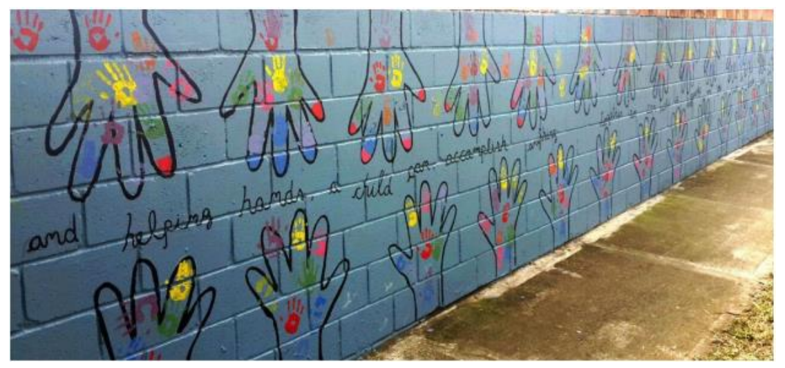
Example from Roots & Shoots Medellín, Colombia