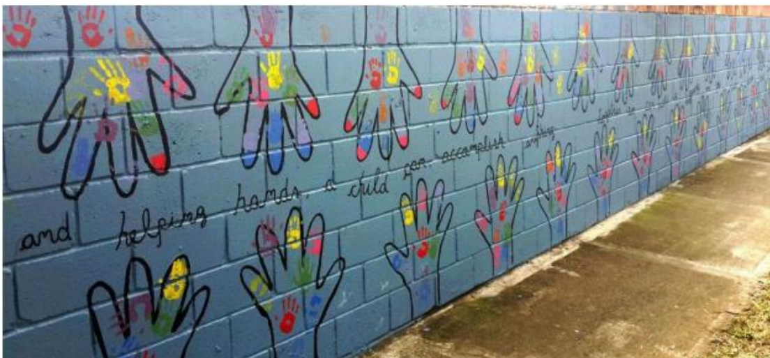
Example from Roots & Shoots Medellín, Colombia

Step 5: Enjoy your masterpiece and share it!