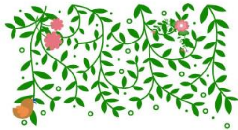
Make your own ivy

Step 3: Divide into smaller groups. Each group will paint a part of the whole.